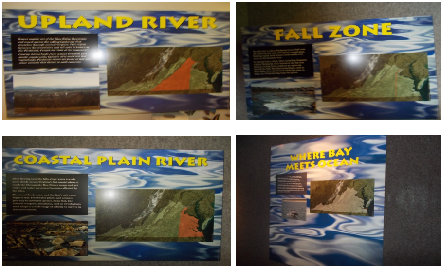
Fig. 2. The VAQ’s “Journey of Water” exhibit series follows the course of water from a mountain stream to the ocean. The different exhibits represent different stages in the journey.